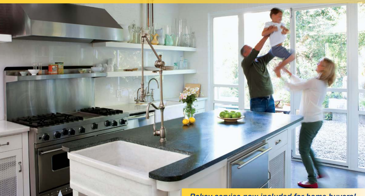
Rekey service now included for home buyers! Up to 6 keyholes and 4 identical keys

45 YEARS People Helping People<sup>ss</sup>